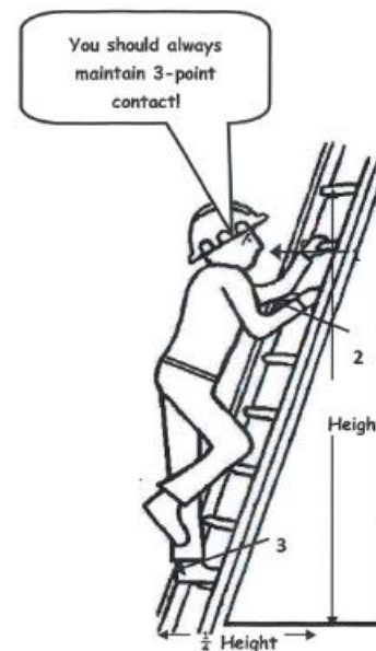
For every 1m (3.28 ft) high, the ladder base should be out 0.25m (0.82 ft)