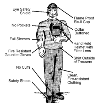
Figure 3. Select clothing to provide maximum protection from sparks and hot metals