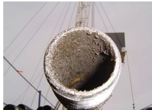
Scale containing NORM on service line

NORM's are often found in rocks or sand, oil and gas production residue such as mineral scale in pipes, sludge and contaminated equipment, coal ash and on filter media such as the desiccant and gas filters. NORM's can also be present in consumer products, including common building products such as brick and cement blocks, granite counter tops, glazed tiles, phosphate fertilizers and tobacco products. High hazard locations include: