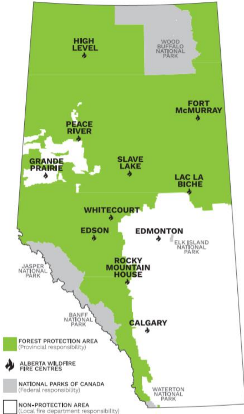
Figure 1 – Alberta Forest Protection Area